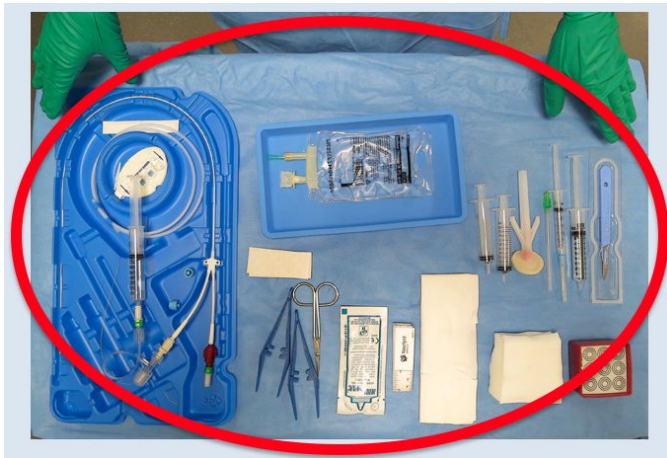
Fig 1. Surgical-ANTT® for PICC insertion Medication administration

ANTT® Risk assessment involves the practitioner assessing the difficulty of maintaining asepsis of all Key-Parts. The practitioner determines that there are multiple Key Karts requiring protection and significant manipulation, the procedure area is large and/or the Key-Site (the insertion site) is particularly invasive. To maintain asepsis, Surgical-ANTT® is required. (Fig 1).